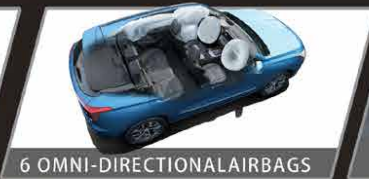
6 OMNI-DIRECTIONAL AIRBAGS