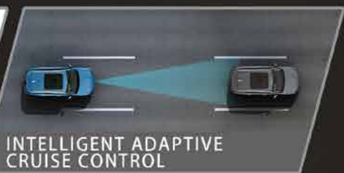
INTELLIGENT ADAPTIVE CRUISE CONTROL