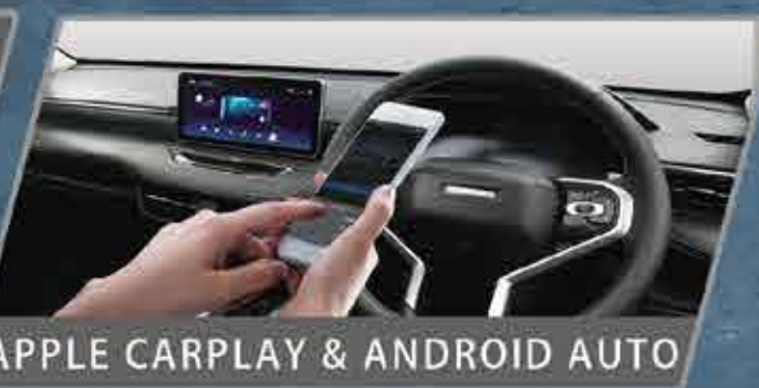
APPLE CARPLAY & ANDROID AUTO