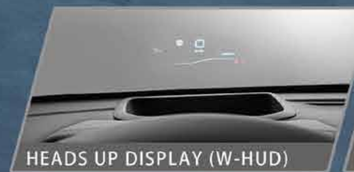
HEADS UP DISPLAY (W-HUD)