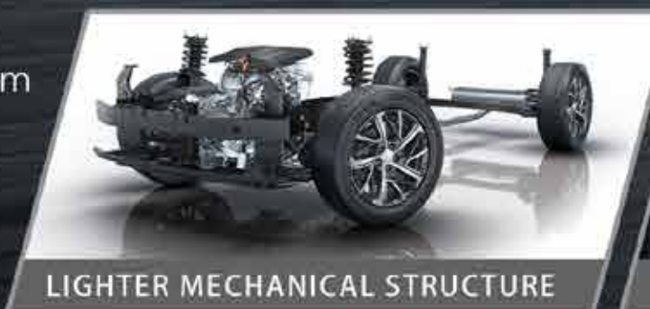
LIGHTER MECHANICAL STRUCTURE

Haval Jolion's L.E.M.O.N. platform is a highly intelligent modular technology platform that boasts the advantages as follows: flexibility, high performance, high safety and lightweight.