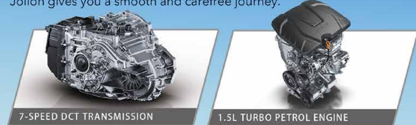
7-SPEED DCT TRANSMISSION

Equipped with the 1.5L Turbo Petrol engine, boosting output to 156 ps and 220nm of torque and the second generation 7-speed DCT that increases efficiency to provide a more direct drive feel, Haval Jolion gives you a smooth and carefree journey.