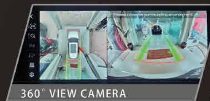
360° VIEW CAMERA