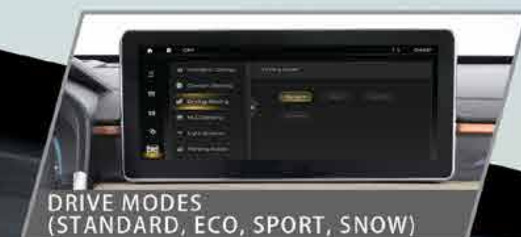
DRIVE MODES (STANDARD, ECO, SPORT, SNOW)

Standard / Sport / Economy / Snow driving modes are available to meet the driving needs of different road conditions.