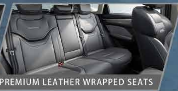
PREMIUM LEATHER WRAPPED SEATS