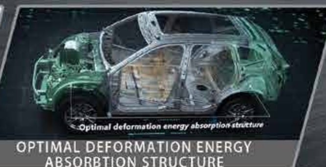
OPTIMAL DEFORMATION ENERGY ABSORPTION STRUCTURE