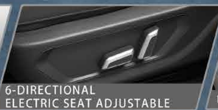
6-DIRECTIONAL ELECTRIC SEAT ADJUSTABLE