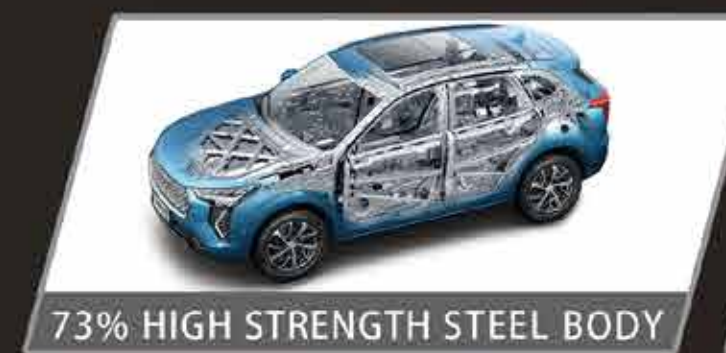
73% HIGH STRENGTH STEEL BODY

Jolion is a vehicle that embodies intelligent thinking. From sleek lines to aluminium vortex alloy wheels and features that are designed to keep you safe on the road, this SUV is sure to get attention on and off the road.