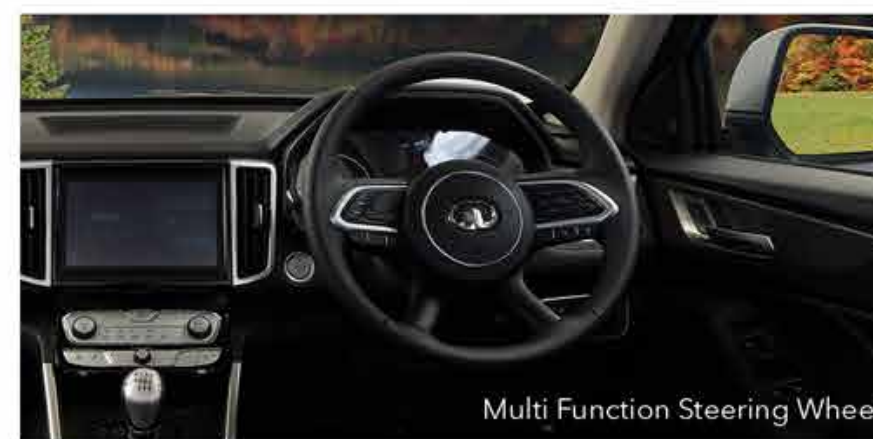
Multi Function Steering Wheel