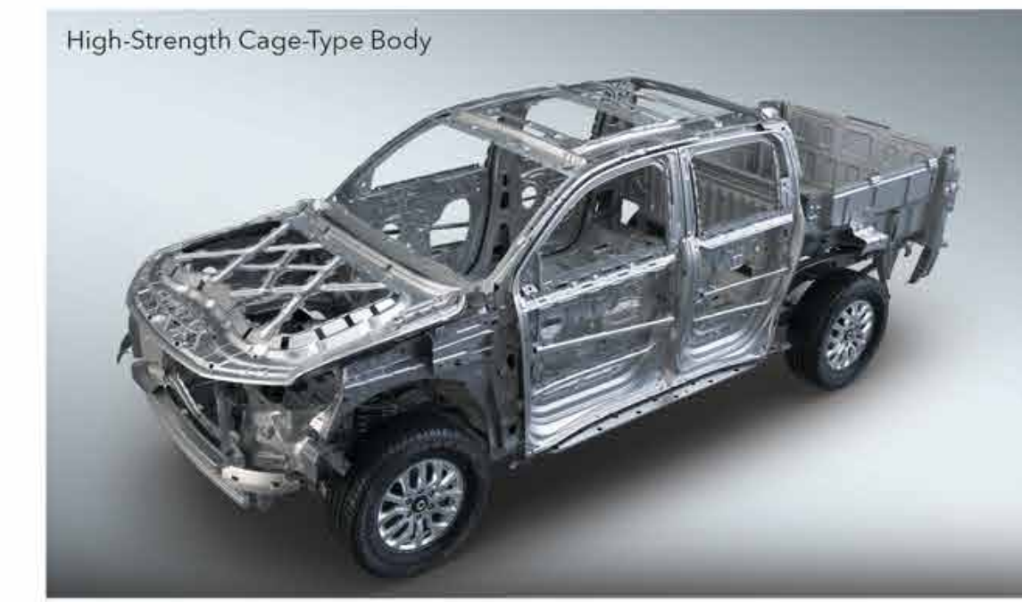
High-Strength Cage-Type Body