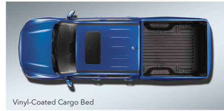
Vinyl-Coated Cargo Bed