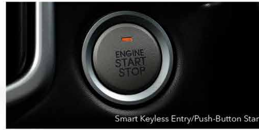
Smart Keyless Entry/Push-Button Start