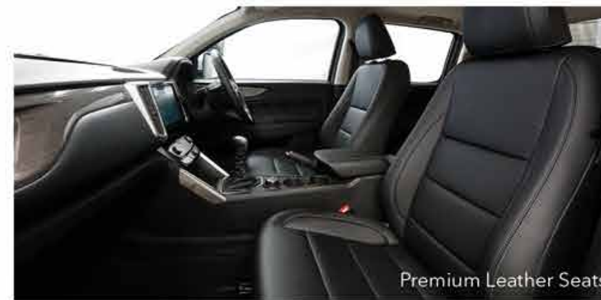
Premium Leather Seats

Discover the thrill of driving in the refined, European designed cabin, with best-in-class features you will need. The driver can also feel the benefit of it's many features, which in turn make the drive more comfortable and luxurious.