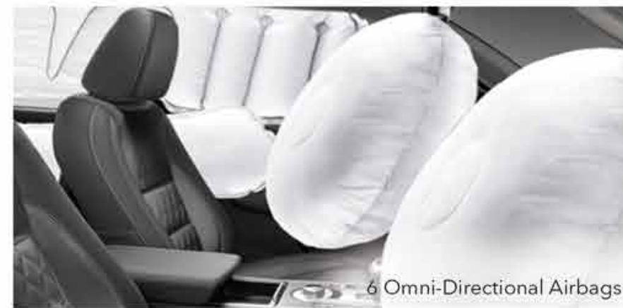
6 Omni-Directional Airbags

The GWM Poer was born to tackle the toughest jobs but it was also built smart with a full suite of comprehensive safety systems designed to protect occupants and other road users.