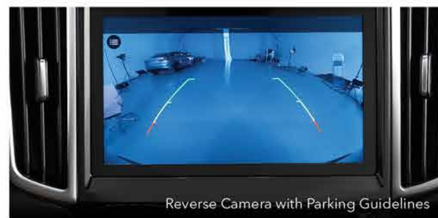
Reverse Camera with Parking Guidelines