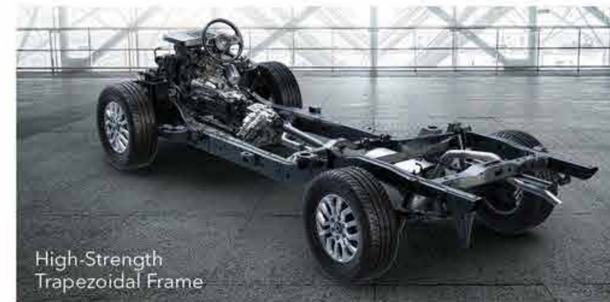
High-Strength Trapezoidal Frame

High-strength trapezoidal frame Maximized the loading capacity of tray Higher loading capacity for greater career development.