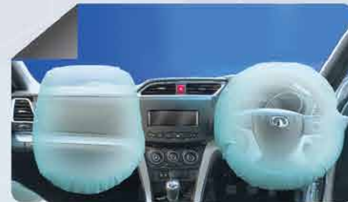
Driver and Front Passenger Airbags