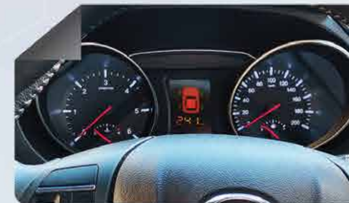
TPMS (Tyre Pressure Monitoring System)