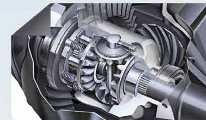
Differential Locking System