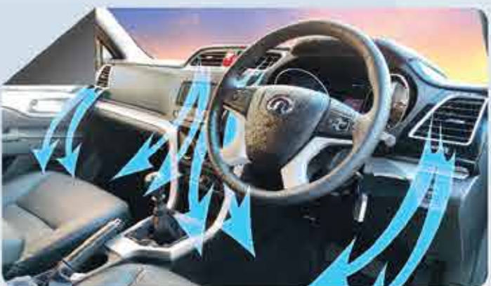
Automatic Air Conditioning