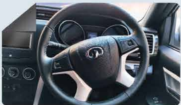
Hydraulic Power Steering