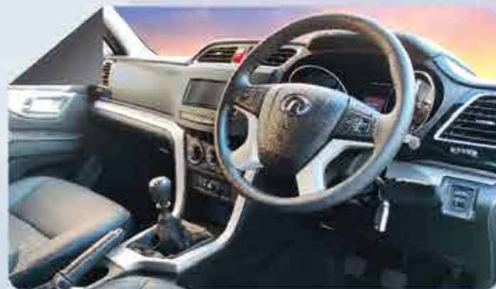
Luxury Interior (Black)

On the Wingle 5's chiselled exterior you'll notice sporty blackened headlights that are complemented by the sleek chrome plated front grille and outdoor handles. • Front and rear foglamps • Sturdy alloy wheels • Electronically adjustable rear mirror with turn signal light