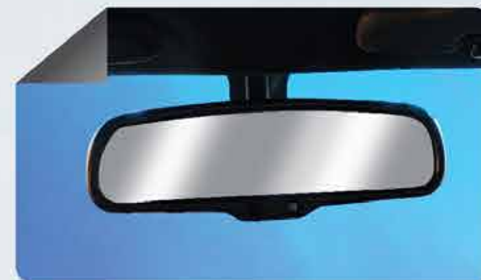
Electrochromic Rear-view Mirror