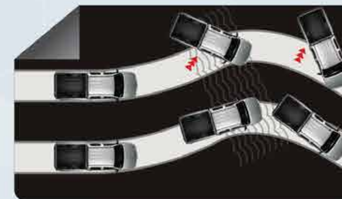
ABS (Antilock Braking System) + EBD (Electronic Brakeforce Distribution)